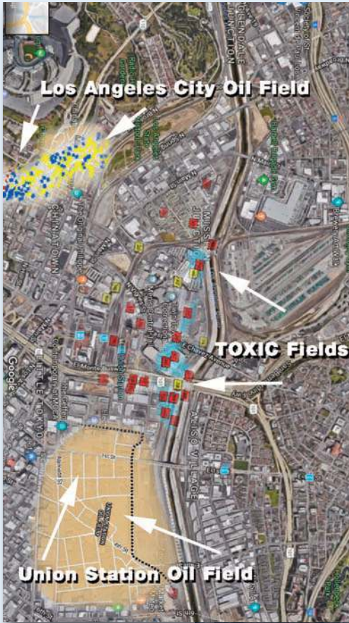
data from LINK EIR Report