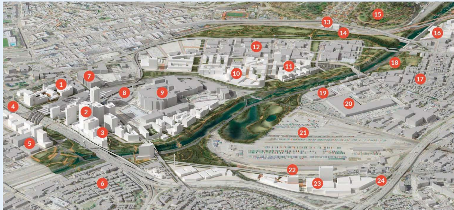
City of LA - Los Angeles River Ecosystem Restoration Study