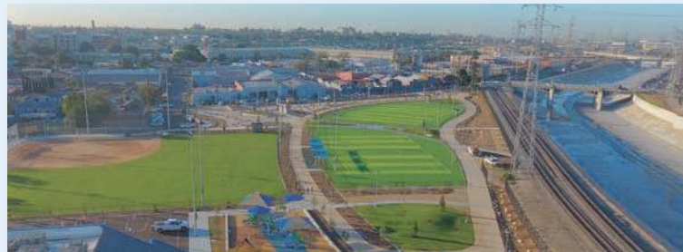
City of LA - Albion Riverside Park

This new bridge is required for the HSR to pass underneath, but in this case the rail bed was so high the bridge will rise upwards of 73 feet higher, and will need a very long ramp up and down on either side of the LA River, taking out many cross streets and leaving visitors quite a journey to exit the area.