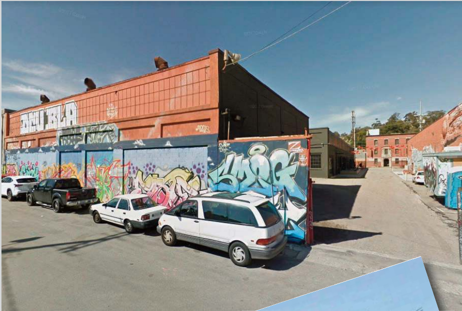
1729 - 1743 Naud Street - Baby's All Right