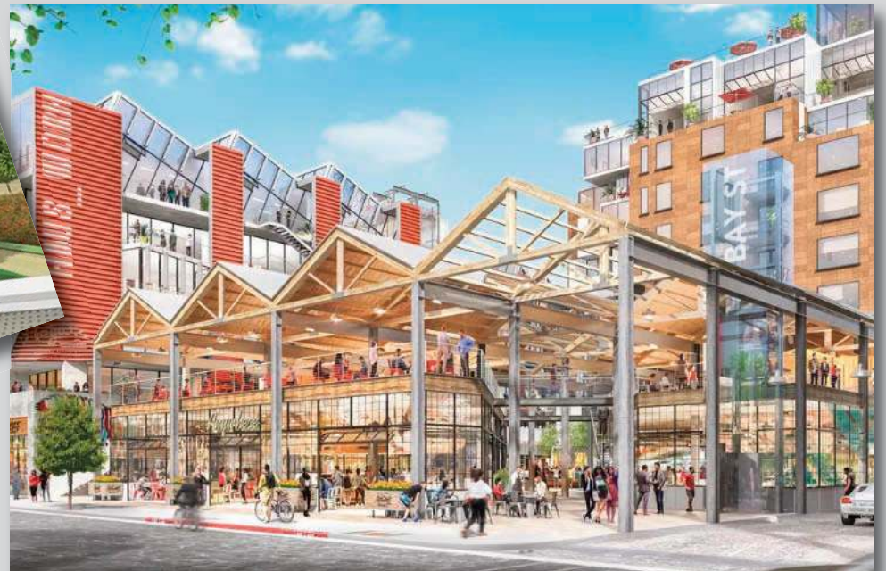
2111 Bay Street - near 7th Street Arts District